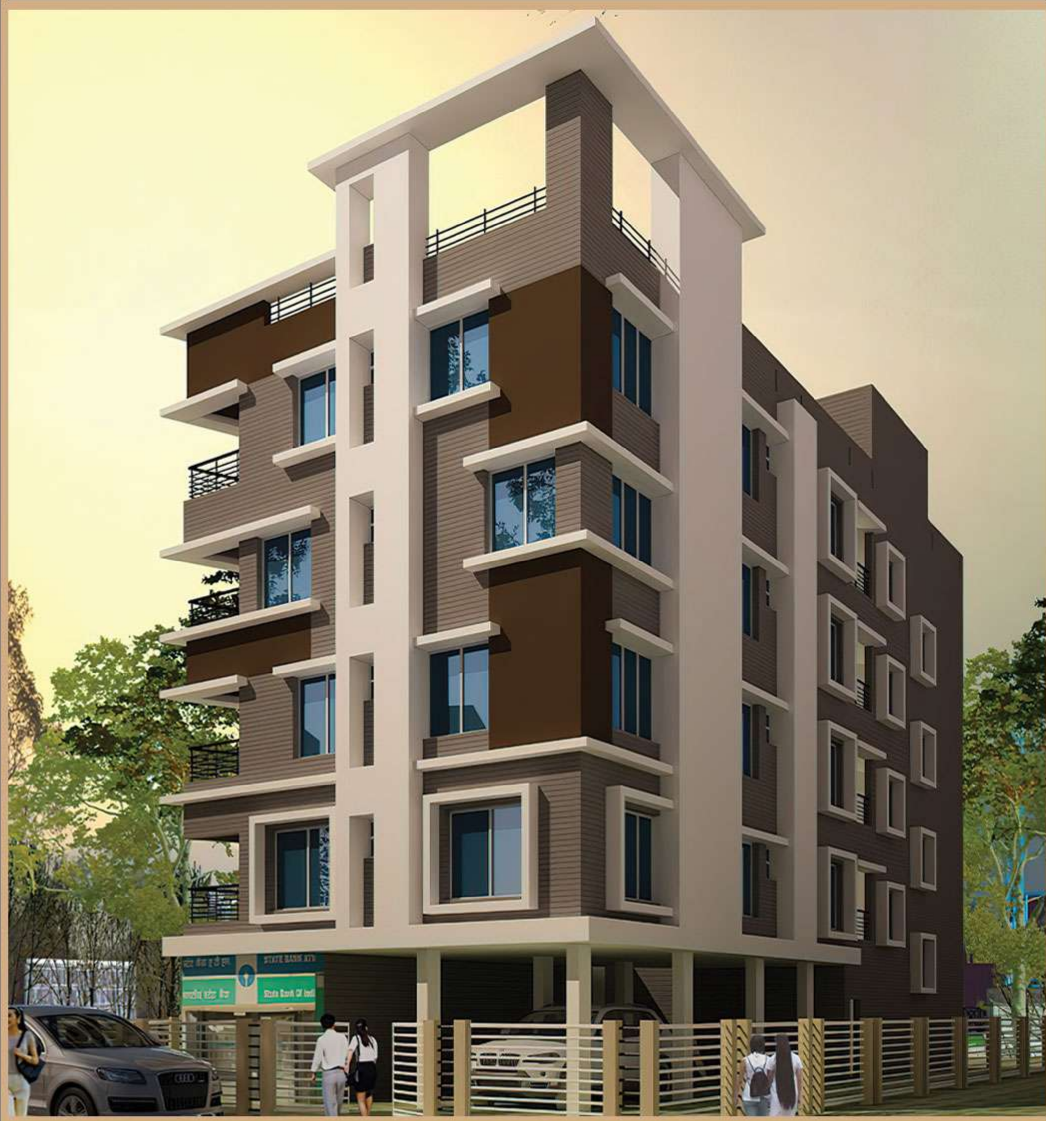
4B, MOTILAL NEHRU ROAD