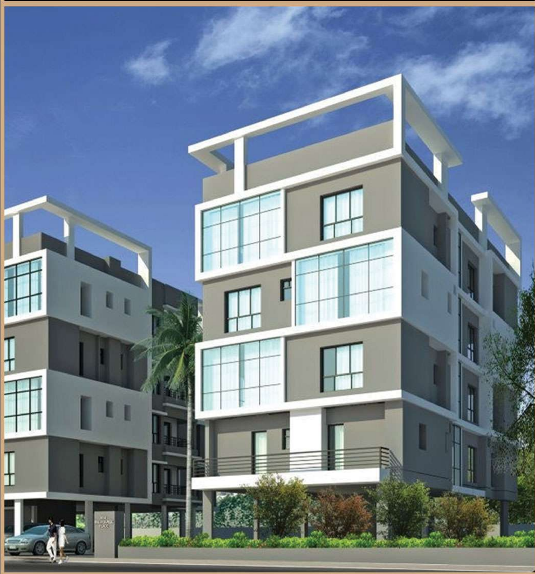
46/4, BALLYGUNGE PLACE