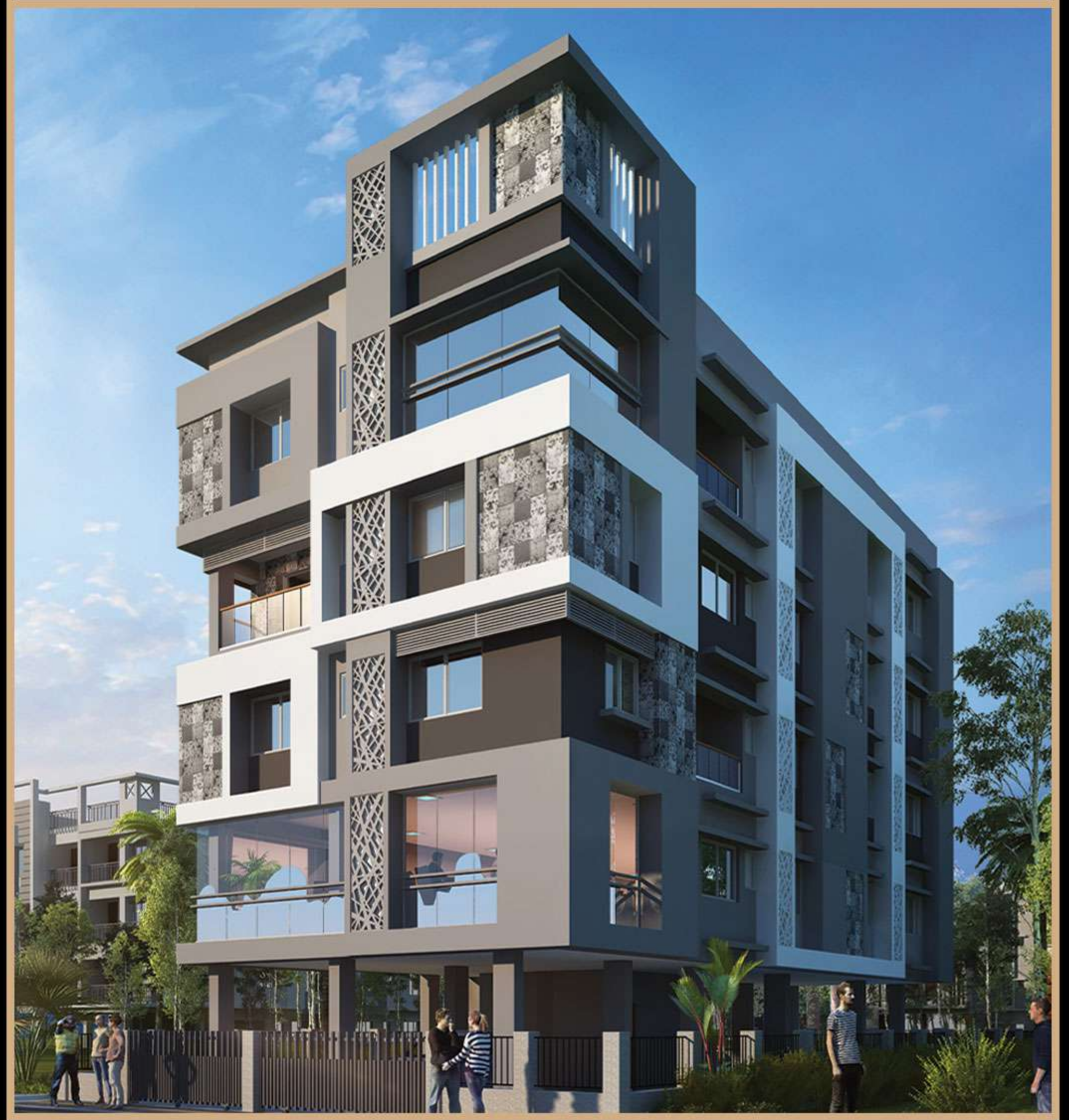
44, LAKE TEMPLE ROAD